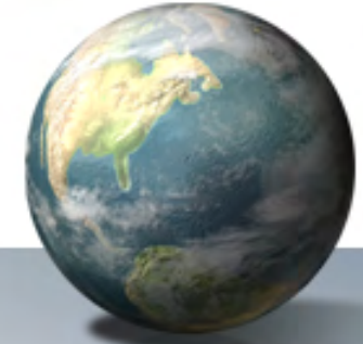
Landfill Methane Production